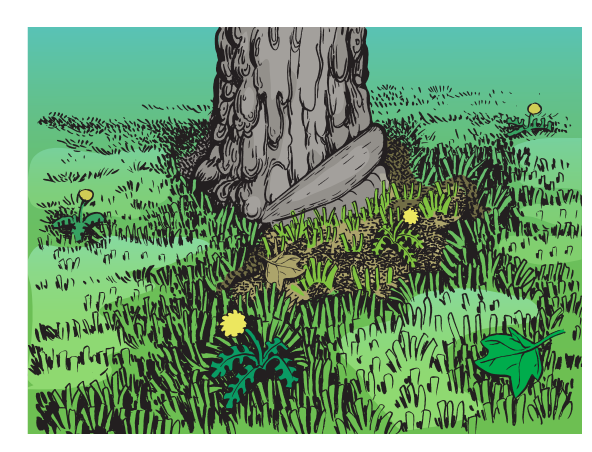
Girdling root as tree matures

Roots should not twist or circle in the container. Remove the root ball from the container for inspection, paying special attention to larger, exposed roots. Circling roots may girdle and kill other roots or the entire tree if wrapped around the lower trunk.